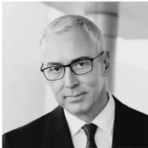
Drew Pinsky, MD Internal Medicine, Addiction Chief Medical Board Member